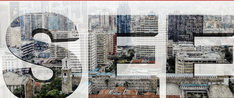
SOCIETY ENVIRONMENT ECONOMY